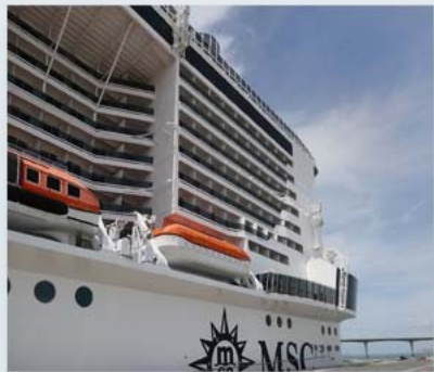
departing from La Rochelle