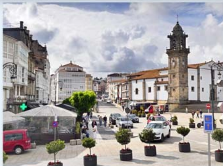
a tour to Betanzos, Galicia