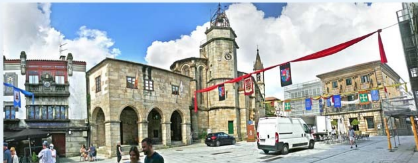
Torre de Reloxo