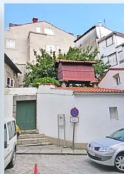
A hórreo (grain house) in Rua Nova. Raised from the ground, to keep rodents, out by stone pillars. It is believed to date from 1219.