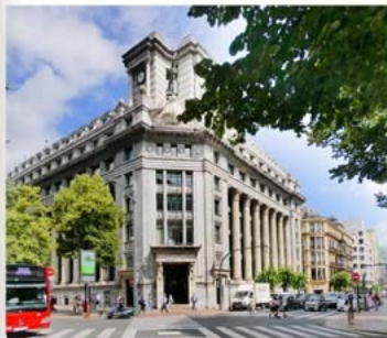
Banco Bilbao Vizcaya Argentaria, the Spanish multinational financial services company. Appears to be a former Post Office building as it has the statue of Mercury at the top.