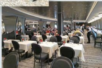
Harrogate Spring water was always served