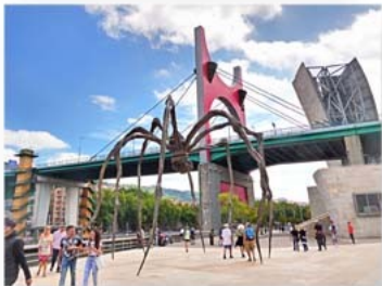
Maman by Louise Bourgeois, 2001 bronze, marble, and stainless steel