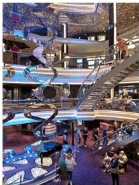
the mirrored ceiling is reflecting the upper deck