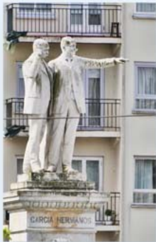
Garcia Navaira Brothers Statue