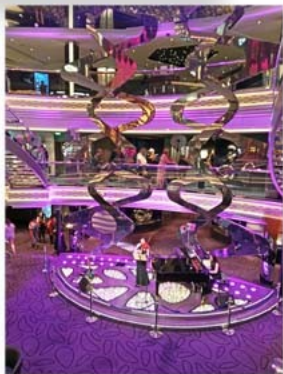
the Atrium and Galleria lighting in the morning then in the evening