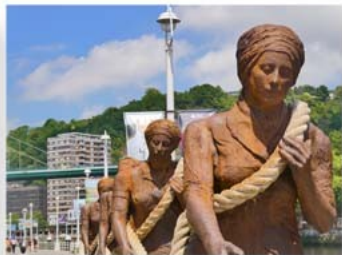
"Las Sirgueras", by artist Dora Salazar, recognizes the importance of women's work and the path to equality. The work pays tribute to the figure of the sirgueras (the rope girls), women who towed vessels along the estuary using only a rope and their own strength.