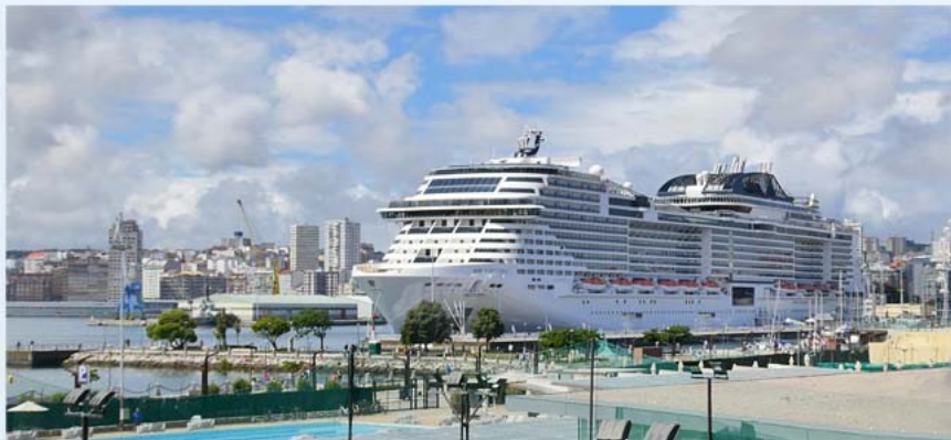
MSC Virtuosa at La Coruña