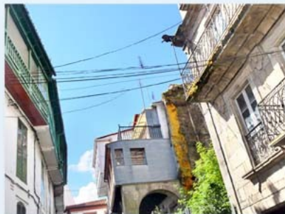
the yellow areas are of polyurethane foam used to waterproof the wall which is exposed to the weather during renovation