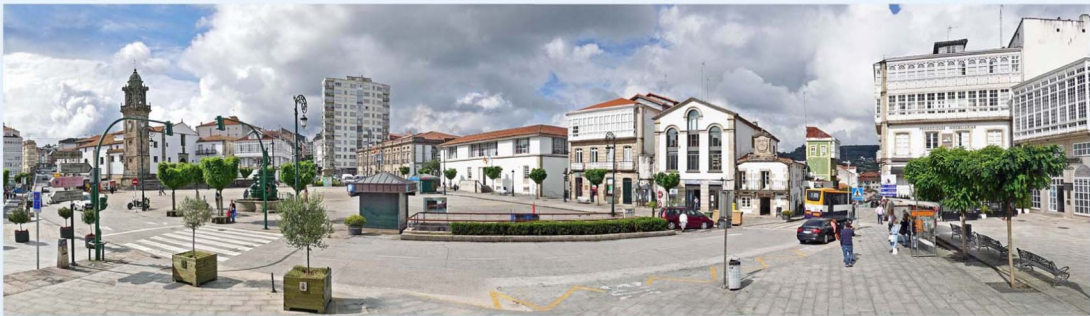
Praza de Irmáns García Naveira, Betanzos