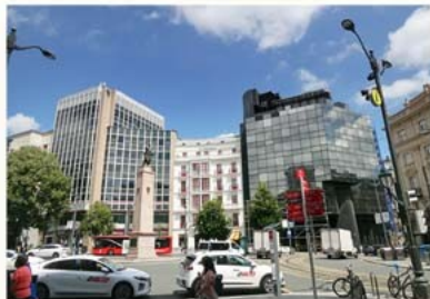
Plaza Circular, Gran Vía de Don Diego López de Haro and statue of Don Diego López de Haro