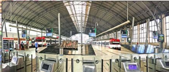
Estación de Abando Indalecio Prietom - Bilbao-Abando Railway Station. The stained glass panel was made in 1948 by Jesús Arrechubieta, depicting diverse activities typical of Biscayan society.