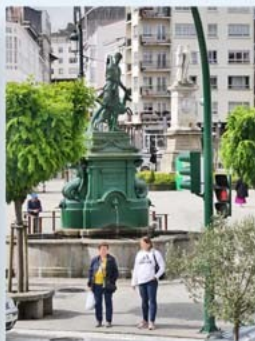
Diana the Huntress Fountain