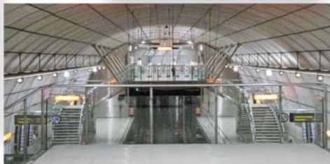
Moyúa metro station on Federico Moyúa Plaza The contract for the underground metro system in Bilbao was awarded to the architects Sir Norman Foster and partners in 1988