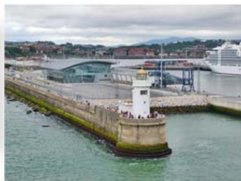
Leaving Getxo, Bilbao

Enchanted Princess, a sister ship to Sky Princess, left at 4pm and we left an hour later. About a mile off-shore Enchanted Princess stopped and a tender came ashore, presumably with a passenger or crew member needing emergency treatment.