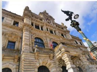
the Gran Vía de Don Diego López de Haro is the main avenue of Bilbao