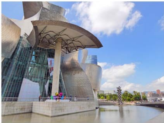
Guggenheim Bilbao Museoa