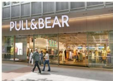
Gran Vía de Don Diego López de Haro