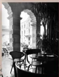
Café de la Paix in Rue Chaudrier & Place Verdun

The café was refurbished around 1900 to become the Café de la Paix then coffee room, with its intact Belle Époque decor, restored in 1931.