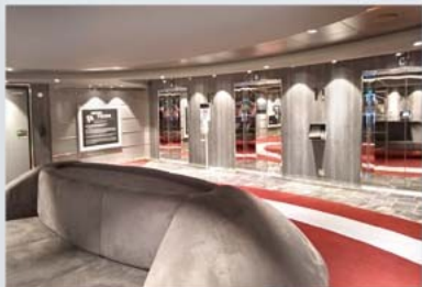
a lift foyer