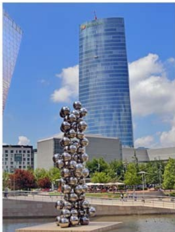
"Tall tree and the eye" by Anish Kapoor, seventy-three reflective spheres in stainless steel