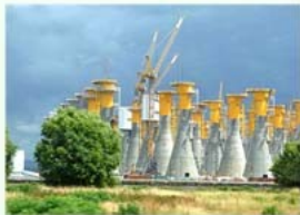
bases for wind turbines awaiting transport to sea