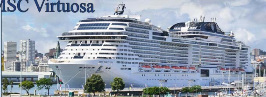
Virtuosa at La Coruña