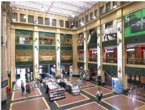
an expensive €9 lunch in Burger King at the railway station