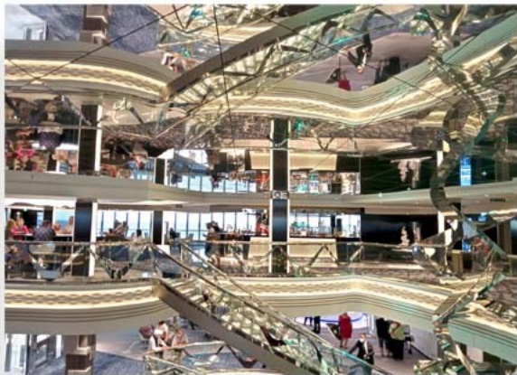
the ceiling is a huge mirror - the image below has the reflection removed