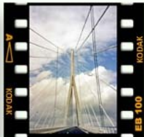
An overnight crossing on 19 June, 1996, from Portsmouth to Le Havre on P&O Ferries with our Toyota Corolla and returning the next day. Photo taken with 35mm Samsung 35mm ECX1