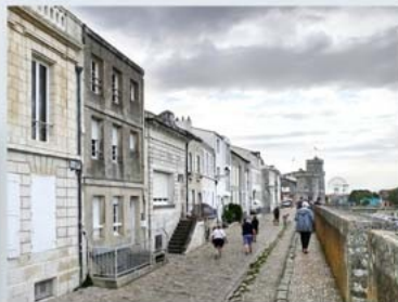
a walk around La Rochelle