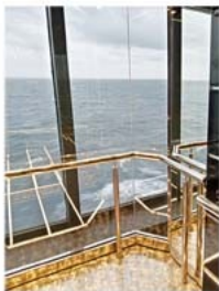
small "outside panoramic" lift close to our stateroom on the starboard side