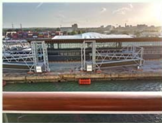
Saturday, 25th June, arriving at the Horizon Cruise Terminal in Southampton