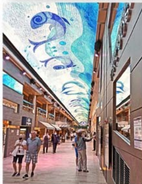
Galleria Virtuosa, decks 6 and 7