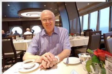
breakfast in the Minuetto Restaurant on deck 6