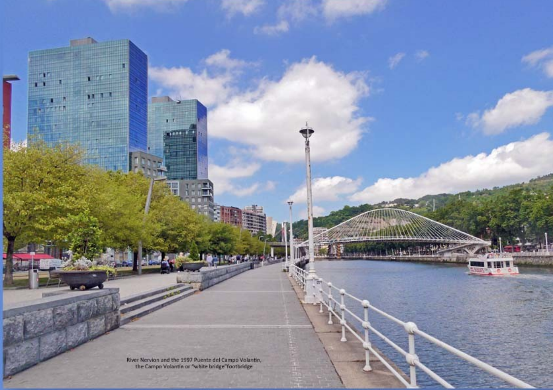
River Nervion and the 1997 Puente del Campo Volantin, the Campo Volantin or "white bridge" footbridge