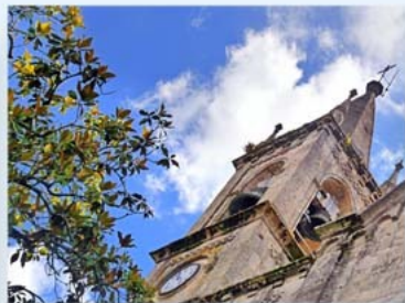
the Church of Santiago