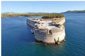
Tvrdava sv. Nikole (St. Nicholas fortress)