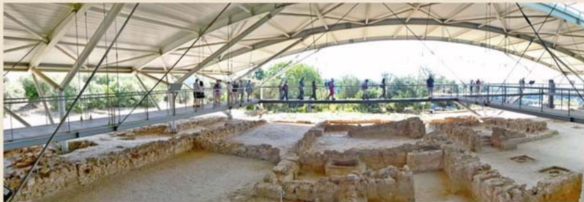
Palace of Nestor a late bronze-age Mycenaean structure