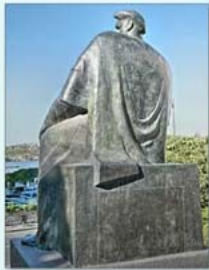
Peter Krešimir IV was King of Croatia and Dalmatia from 1059 until his death in 1074/1075. (William, Duke of Normandy became King of England in 1066)