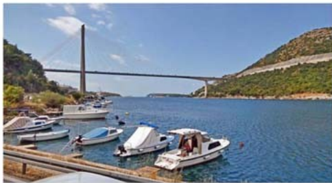
Most (Bridge) Dr. Franja Tuđmana and Viking Venus berthed at the Gruz cruise port just north of Dubrovnik