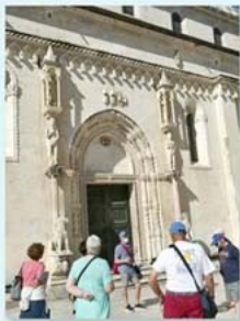
the Lion Gate of Katedrala sv. Jakova, St James cathedral, Why have Adam and Eve got a belly button?