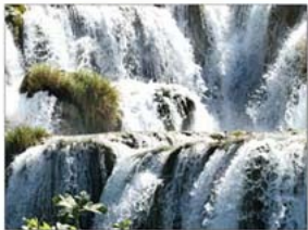
Krka National Park