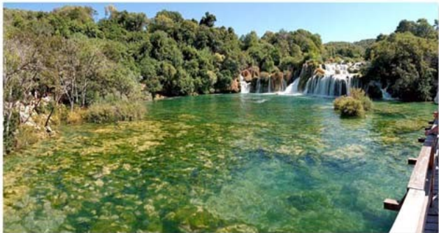
the Skradinski Buk waterfall