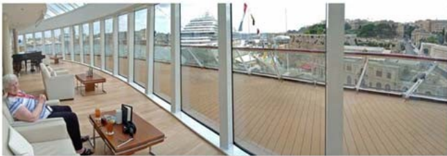
in the Explorers' lounge