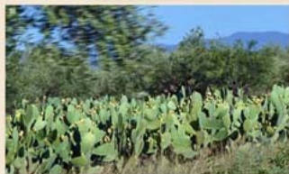
Opuntia, commonly called prickly pear cactus