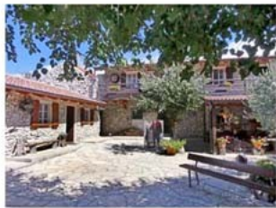
Odžaković farmhouse in the village Nadin