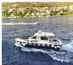
Pilot boat Garofalin as we leave Dubrovnik