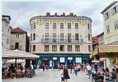
a walking tour of Split in the morning