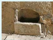
Amor De Cani (for the love of dogs) water source