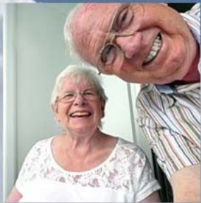
back on the ship and room-service lunch