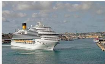
Costa Firenze arriving