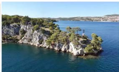
departing from Šibenik and a twisting course for the Pilot through the 460 feet-wide gap in the St Anthony Channel