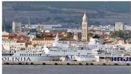
departing from Split