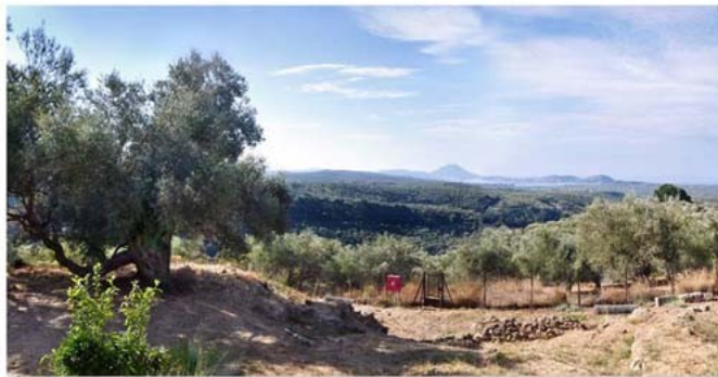
olive trees producing the "Kalamata olive"