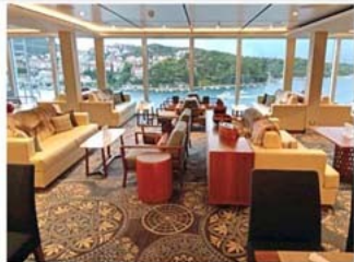
a coffee in Mamsen's Lounge