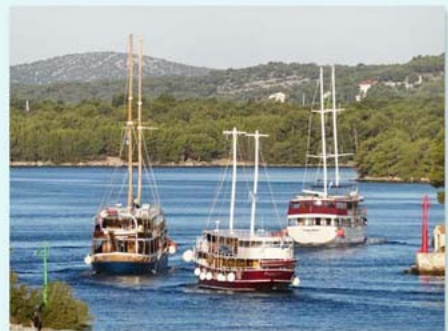
three tourist yachts had been waiting for Viking Venus to navigate the narrow part of the channel