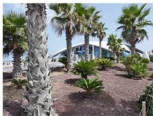
a drink of Kinzie, a product of Malta, at the Malta National Aquarium