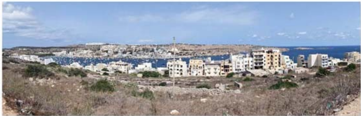
Xemxija across Xemxija Bay