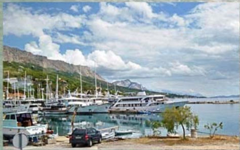
a trip on the Cetina River starting at Omiš