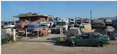
a typical view across Greece and Croatia